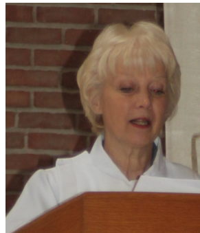
Mary

Some of the most glorious events in the life of Jesus fall within the 40 days of lent—a time to rejoice throughout the season not just on Easter. It is also the time that Jesus did his most concerted teaching---the lessons were coming fast and furious , he wanted to get everything in that had been given him to teach. It has always been difficult for me to understand why , if all of lent points to the resurrection of the lord, the culmination, that we spend all these 40 days remembering how terrible we all are and will just fall away to reveal my true Spirit. Apocalyptic perspective. Repentance means to turn away - yes not only turn away from error but turn and change your entire perspective and live in God's kingdom now. Christ says if you keep just 2 commandments, you taste the new world NOW, you are saved. So I rejoice at this knowledge. I do not start out parading my ashes to others as is reprimanded by Jesus in today's gospel---dust to dust—no—if we truly believe that we are a spiritual being in an earthly existence then (continued...)